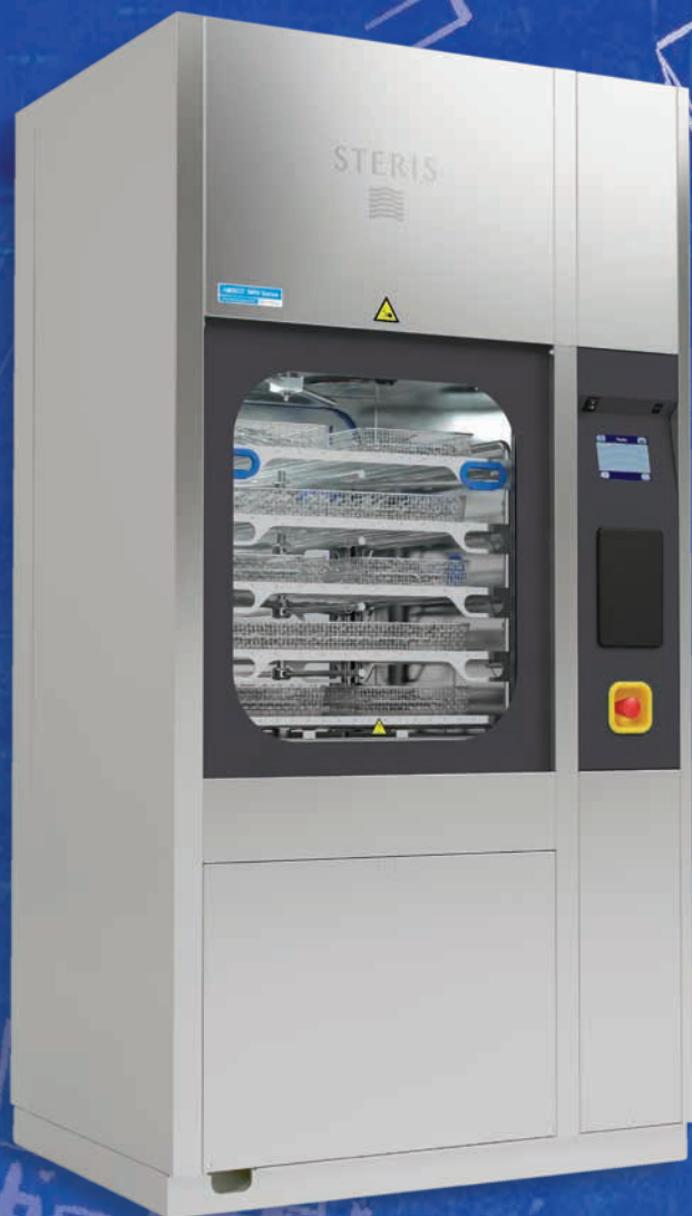
Fig. 67 Fig. 76 it fits.

Designed specifically for the fast-paced SPD, the AMSCO 5052 Washer/Disinfector fits your needs for performance, schedule and ease of use.