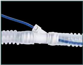
Y-Connector allows the pencil cord to be housed inside the tubing.