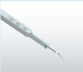
HAND CONTROL PENCIL