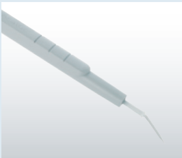
FOOT CONTROL PENCIL

Employed use of sheaths promotes pencil longevity, speeds changeover from patient to patient, and prevents pencil exposure to contaminants.