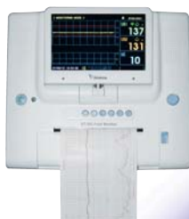
Wall mount style